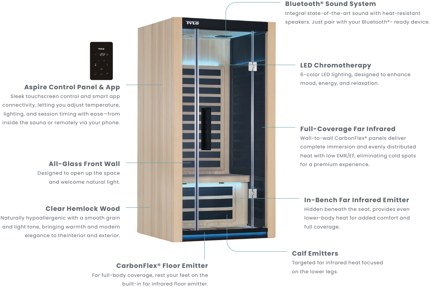
Exterior Front Wall